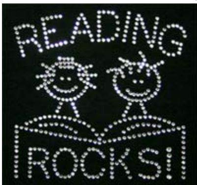
4" x 4"

7. Below are dimensions of three stock prints: