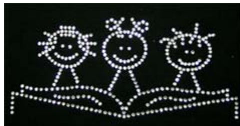
7.5" x 3.5"