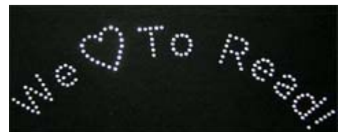
11" x 3.5"